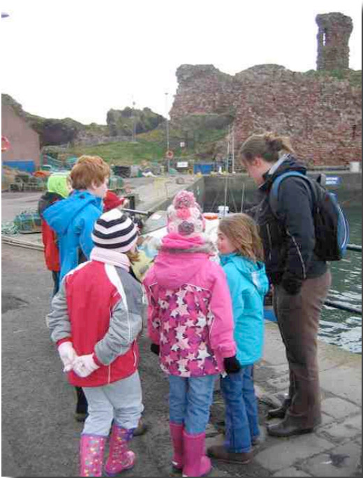
Workshop children take a trip to the harbour to see the kittiwakes...