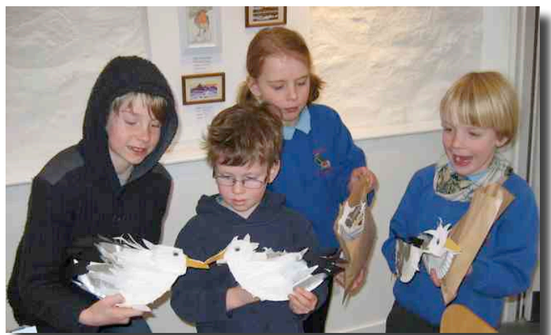
...then back to the museum to 'make their own kittiwake'!

The kittiwakes are back in Dunbar and so a visit to the castle and harbour has also been a popular item on our workshop programme.